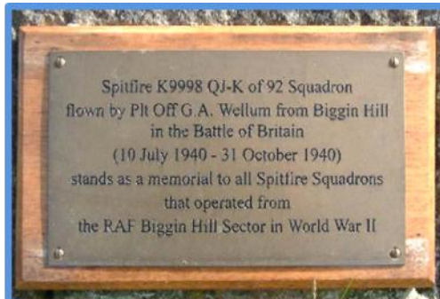
The plaque at the base of Geoffrey Wellum's Spitfire at Biggin Hill