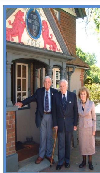
Outside the White Hart at Brasted. Both men knew the pub well when they were Spitfire pilots.